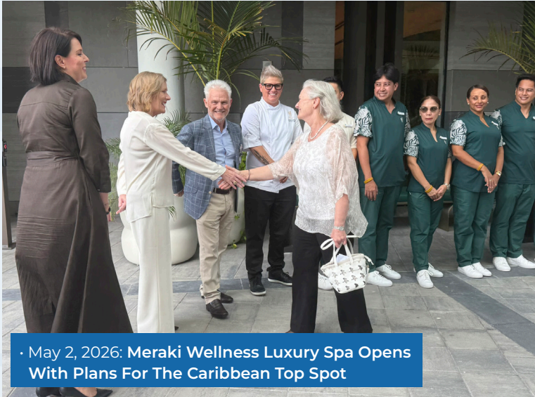
· May 2, 2026: Meraki Wellness Luxury Spa Opens With Plans For The Caribbean Top Spot

Arch & Godfrey was pleased to participate in numerous community events in Q1/Q2 2026, including (but not limited to):