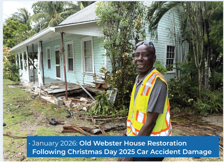
· January 2026: Old Webster House Restoration Following Christmas Day 2025 Car Accident Damage